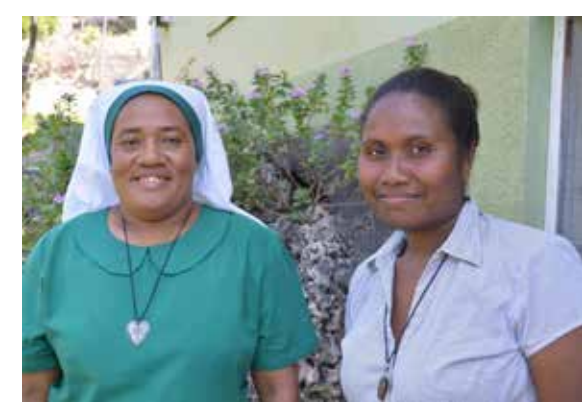
Head Sister and friend.

Second, contact has also been made with one of our existing projects – The Sisters of the Community in Guadalcanal. They are desperately poor, yet growing in numbers. Our project helps replace their collapsed chapel and provides some tinned food variety, instead of their depending totally on their own gardening.