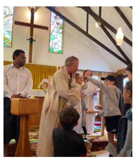
St Luke's. Otatara

Invercargill, absolutely amazing and worth exploring. Come and spend a few days with us. Refresh, renew and revive.