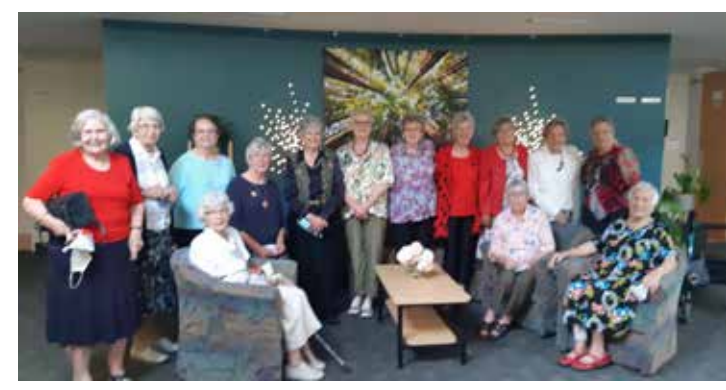
St Luke's Rotorua AAW